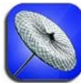
One type of Septal Occluder

A Septal Occluder is passed into the fine tube and advanced through your heart and put into the defect.